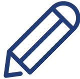
Pencil or Pen