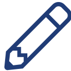
Pencil or Pen